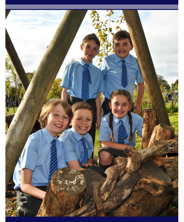
"We are all part of the one school family."